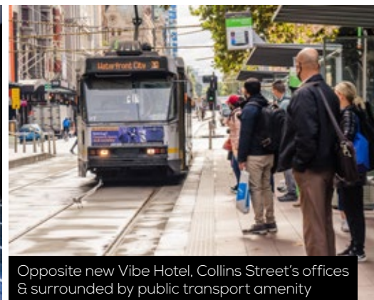
Opposite new Vibe Hotel, Collins Street's offices & surrounded by public transport amenity

FOR FURTHER INFORMATION PLEASE CONTACT THE LEASING AGENTS