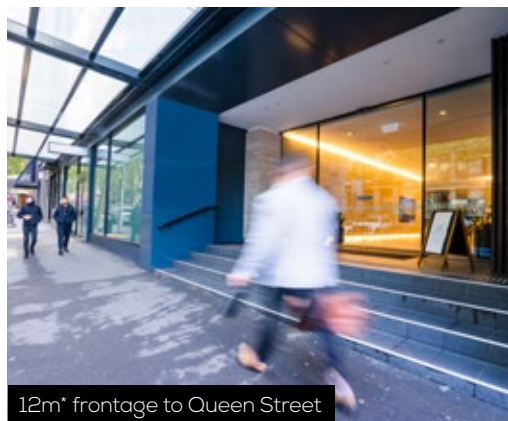
12m* frontage to Queen Street

Available now with flexible lease terms .