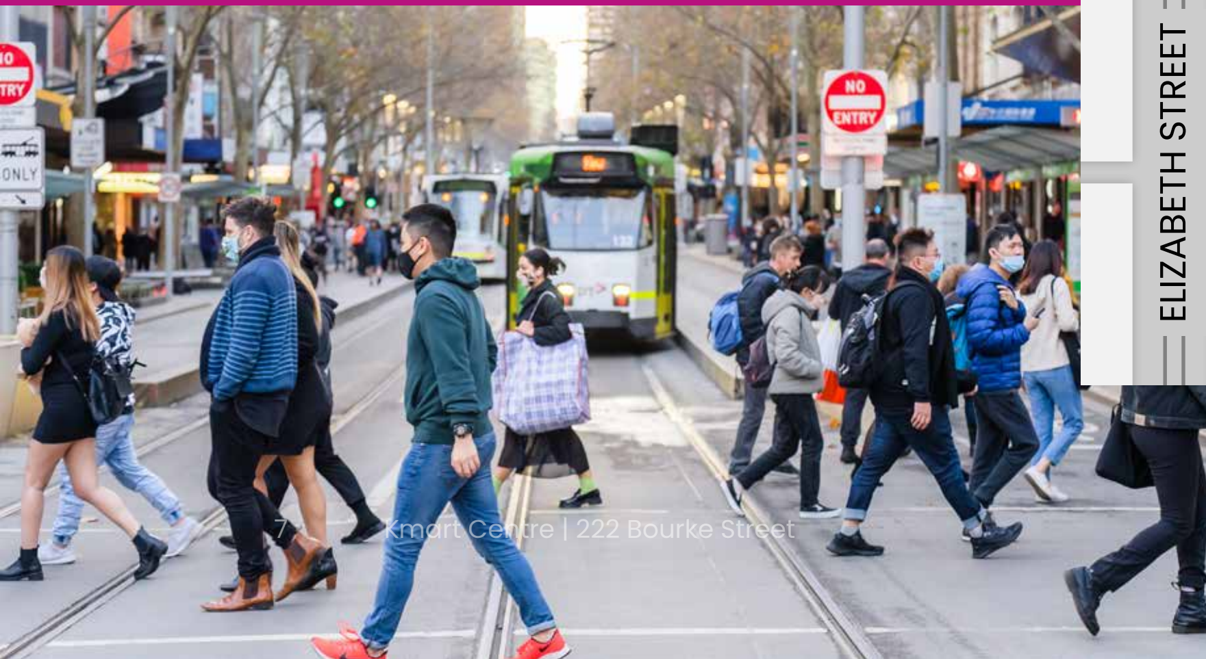
Smart Centre | 222 Bourke Street

Tenants will benefit from significant thoroughfare, with roughly 10,000 pedestrians passing the centre daily, and in-centre security provided 24/7. Bound by major national powerhouses, including David Jones, Myer, JB Hi-Fi, Zara, Telstra and HSBC, at 222 Bourke Street you'll be positioning yourself in good company, at one of Melbourne's most premium addresses.